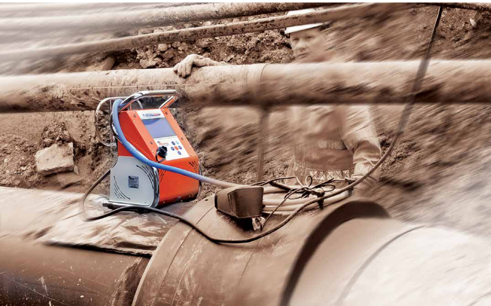
* WORKING RANGE Ø mm