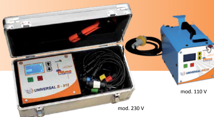
mod. 230 V